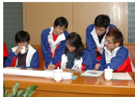
山東工作坊 Workshop in Shangdong