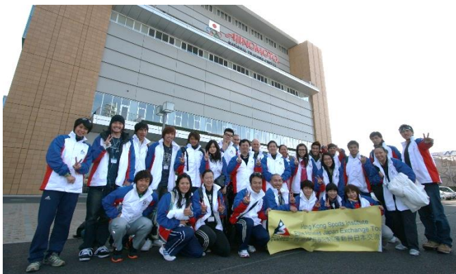
日本國立運動科學學院 Japan Institute of Sports Sciences