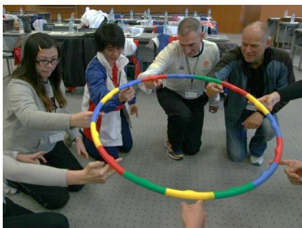
日本工作坊 Workshop in Japan