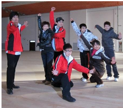
與國家武術隊交流 Exchange with the national Wushu team