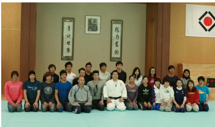
日本柔道學習 Judo learning in Japan