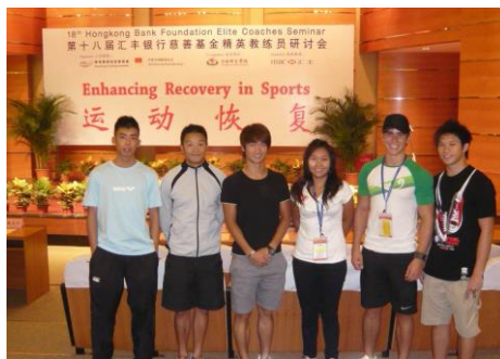
上海研討會 Seminar in Shanghai