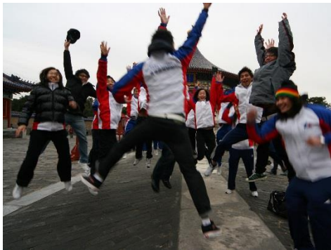
北京天壇 Beijing Tiantan