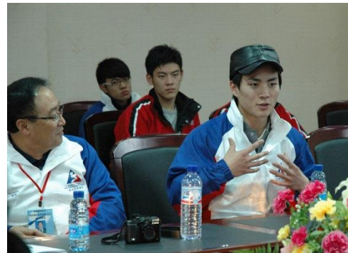
山東研討會 Seminar in Shangdong