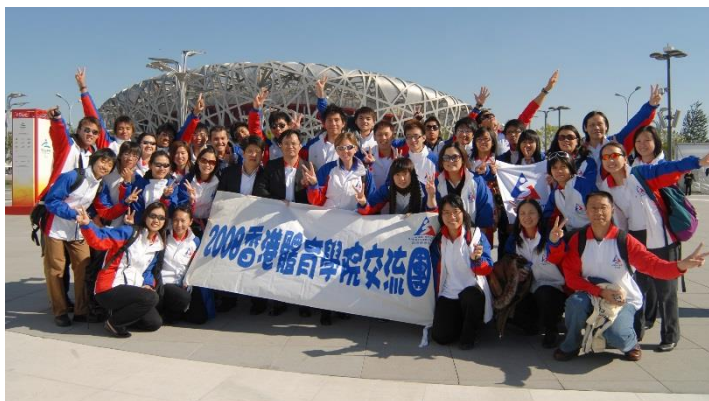
北京鳥巢 Beijing National Stadium