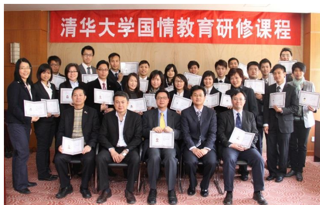
國情研習班畢業 National Study Class Graduation