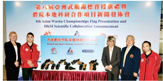
體院與健康鞋專門店合作，為香港武術隊加強科研支援。 The HKSI collaborated with a footcare specialist to enhance scientific support for the Hong Kong wushu team.