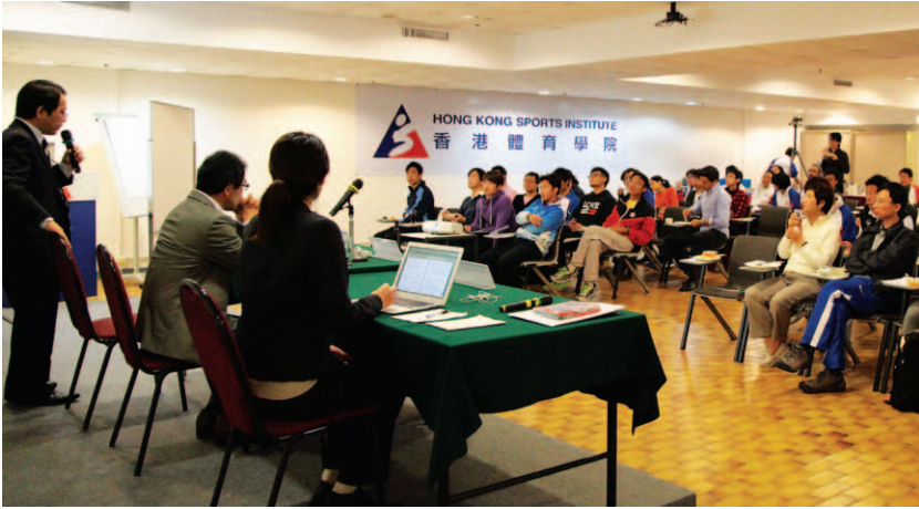
兩名日本運動選材計劃的專家蒞臨體院擔任研討會主講嘉賓。 Two experts from the Talent Identification Programme in Japan were invited to deliver a symposium at the HKSI.