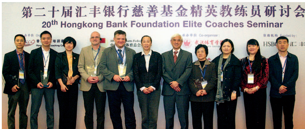
多名來自世界各地的運動專才於精英教練員研討會上就「青少年精英運動員最新發展概況」發表演講。 Professionals from around the world gave presentations on the theme “Young Elite Athletes Development” at the Elite Coaches Seminar.

Jointly organised by the HKCC and the All-China Sports Federation since 1993, the annual event provides a platform for overseas and mainland China experts, as well as local coaching professionals, to exchange ideas related to sports coaching.