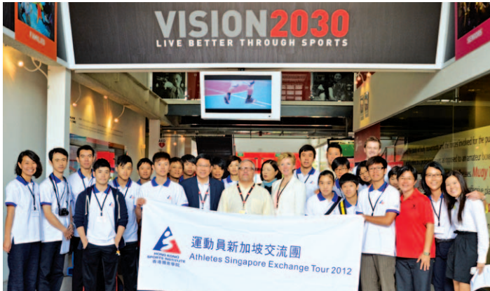
運動員於新加坡交流團期間參觀當地多間體育機構和設施。 The athletes visited various sports institutions and facilities during the Singapore Exchange Tour.