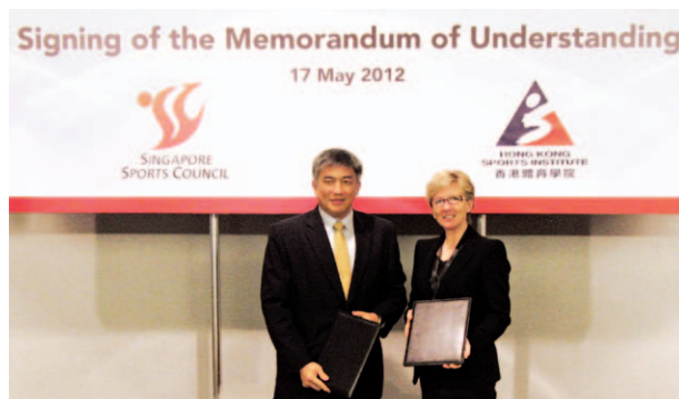
體院與新加坡體育理事會簽署合作備忘錄，在多個領域上制訂合作框架。 The HKSI signed a memorandum of understanding with the Singapore Sports Council to establish a framework for cooperation in various areas.