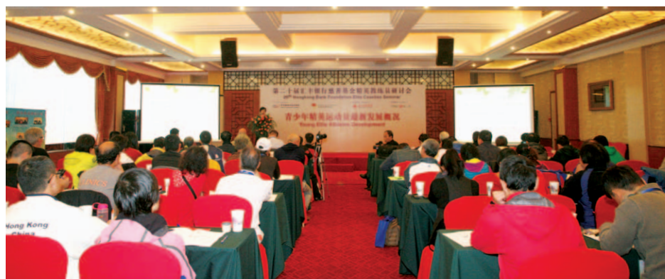
精英教練員研討會成功吸引約100名國內、香港及海外教練參加。 The Elite Coaches Seminar attracted around 100 coaches from mainland China, Hong Kong and overseas.