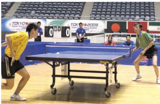
香港代表隊出戰第二屆青少年殘亞運動會 Hong Kong team at the 2 nd Asian Youth Para Games