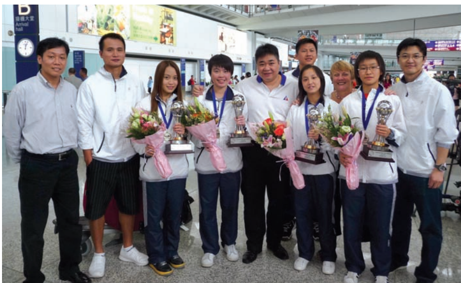
香港青少年女子壁球隊 Hong Kong junior women's squash team

在第六屆亞洲分齡游泳錦標賽，林政達在青少年隊中表現最為突出，協助港隊摘下四面金牌，包括15至17歲組別的男子50米自由泳、100米自由泳、4x100米自由泳接力及4x200米自由泳接力。