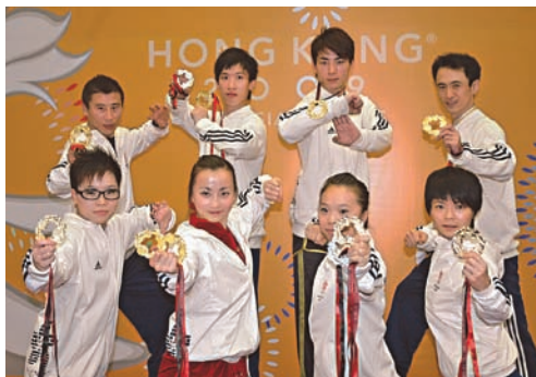
武術隊取得16面獎牌，當中五面為金牌，是香港代表團中奪得最多獎牌的隊伍。 The wushu team won 5 gold medals and 16 medals overall, the highest number among all of the sports in which Hong Kong participated.