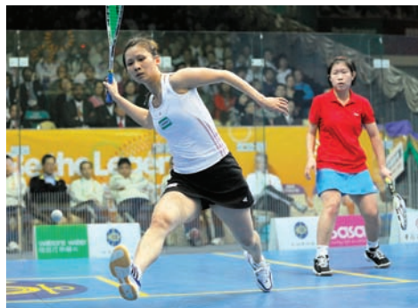
壁球隊囊括七面金牌，當中趙詠賢(前)獨攬三金，成為香港運動員中的金牌大贏家。 The squash team swept all 7 gold medals, with Chiu Wing-yin (front) winning three, the most by a Hong Kong athlete.