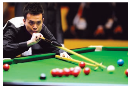
傅家俊(桌球) Fu Ka-chun (billiard sports)