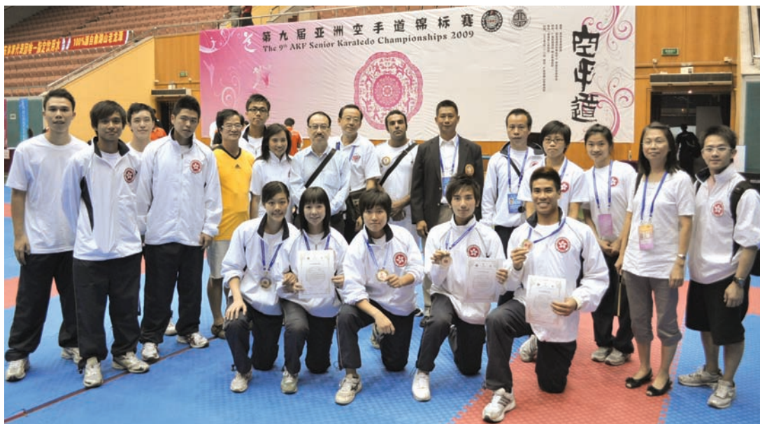
香港空手道隊 Hong Kong karatedo team